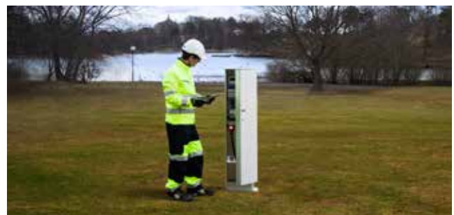
Fig 5: Size comparison between the traditional and new Flygt Concertor® pump control cabinet