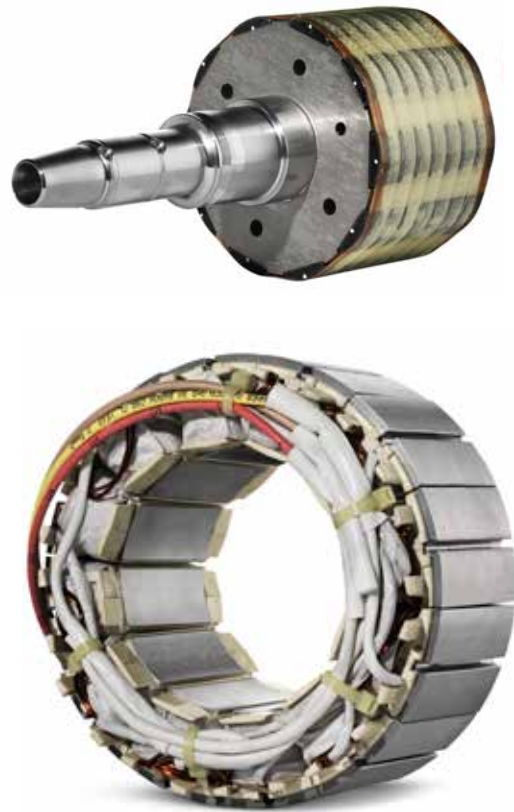
Fig 4: Concentrated synchronous motor (rotor and stator)