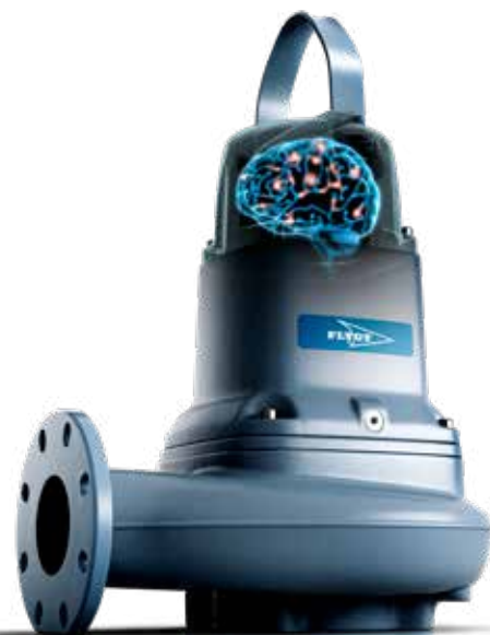
Fig 1: Intelligence integrated into a submersible wastewater pump

Intelligence refers to a pump system that can sense the environment it is working in as well as the load it