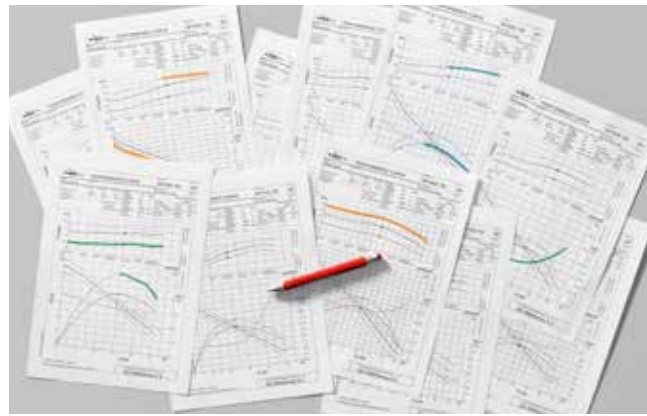
Fig 2: From a complex selection

A new, simpler and more compact high performance synchronous motor further improves pumping system efficiency allowing operation at reduced pump capacity with maintained high motor efficiency. The concentrated winding synchronous motor does this and meets the proposed future super-premium motor efficiency standards (IE4).