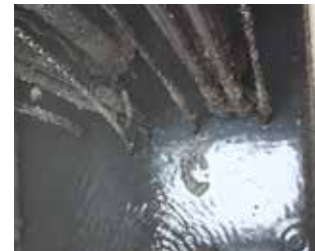
Fig 8: Wet pit surface after