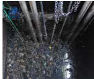
Fig 7: Wet pit surface before (Customer test installation)

When adding a gateway and a Human Machine Interface (HMI) pump and pump system data can be accessed and used. The HMI is required to display and adjust (if needed) system settings to suit user needs. HMI's ranging from basic monochrome displays to full-color touch screen units and smartphone/tablet applications are possible. This allows operators to view and control pumps and the entire pump system on location as well as remotely.